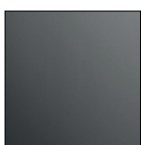
Black High Gloss