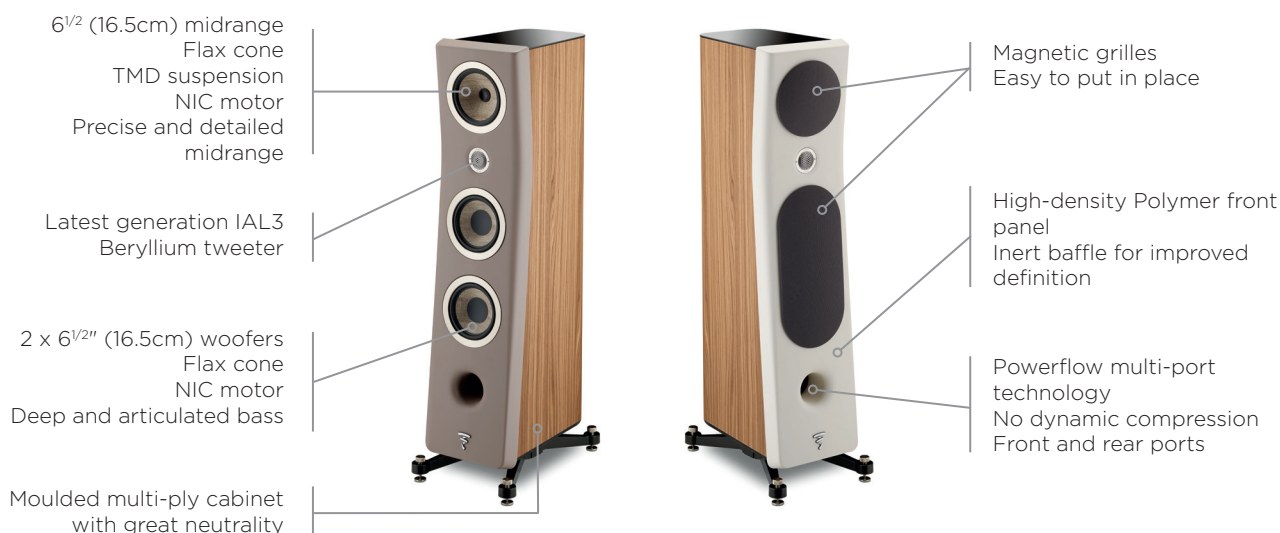
Kanta N°2, Walnut cabinet, Matt Warm Taupe and Ivory front panels

Kanta N°2 is a three-way floor standing loudspeaker totally dedicated to performance. Kanta N°2 is equipped with a new generation IAL tweeter featuring a Beryllium inverted dome and Flax sandwich cone speaker drivers. This is an unprecedented combination of technologies to guarantee precise, detailed and warm sound. Focal's latest acoustic innovations have been integrated into these floorstanders encompassing a modern and distinctive design. These loudspeakers are perfect for rooms measuring up to 320ft 2 (30m 2 ) and they're also ideal for larger rooms of up to 750ft 2 (60m 2 ).