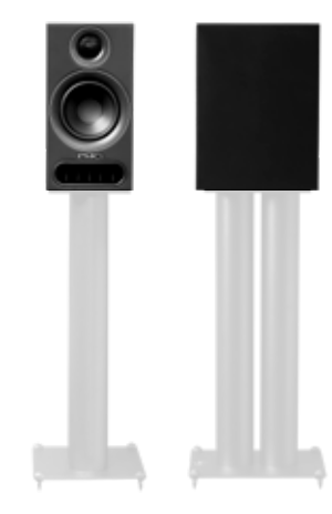
Stands not included