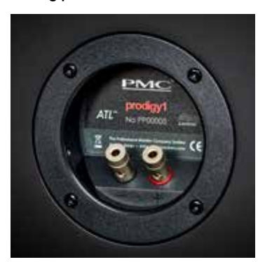
Binding posts accept spade lugs, 4mm 'banana' plugs and bare wire for a connection of the highest integrity.