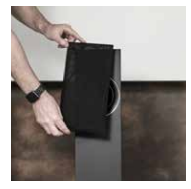
The optional grilles are magnetically attached to the cabinet to eliminate unsightly fastenings.