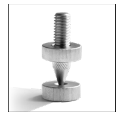
Pucks are included with the prodigy5 to protect sensitive or hard floors from the performance enhancing spikes.